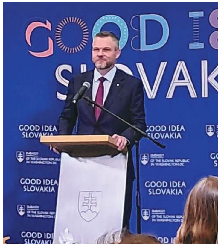
Slovak President Pellegrini speaks at the Slovak Embassy in Washington DC on July 8, 2024.

Pellegrini generated considerable controversy and concern during the Slovak presidential campaign when he argued for a 'peaceful' solution to the Ukraine conflict and characterized his opponent's strong pro-Ukraine position as being in favor of 'war.' In his remarks to the strongly pro-Ukraine audience, Pellegrini sought to clarify his position when he stated "...we need to invest more into wide international understanding that we are not trying to disintegrate Russia, but to change its behavior to one that fully respects its obligation under the UN charter, international law, and its OECD commitments.... Supporting peace...does not mean supporting the aggressor. It is up to Ukraine to decide on this, but a just and sustainable peace can only be a peace based on international law." He then went on to stress that NATO