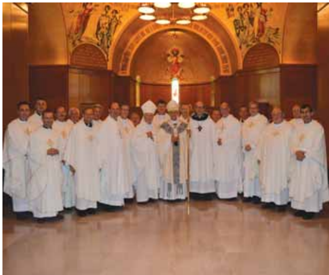
Cardinal Donald Wuerl and Bishop Joseph V. Adamec are shown above with the clergy concelebrants of the pilgrimage liturgy.