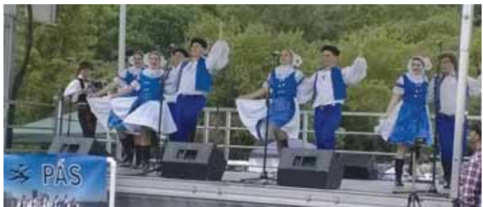
Members of PAS - The Pittsburgh Area Slovak Folk Ensemble entertained with a variety of Slovak music and dances from the various regions of Slovakia.