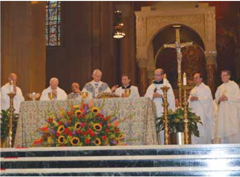
Donald Cardinal Wuerl, Archbishop of Washington, with concelebrants of the pilgrimage liturgy.

Celebrating the 50th anniversary of the dedication of the Slovak Chapel of Our Mother of Sorrows