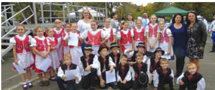
Children of the Czech and Slovak School of Astoria, N.J. entertained with traditional Slovak folk dances.