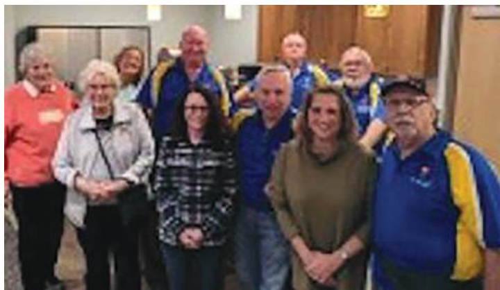
Group 17 officers and members

Group 17, thank you for supporting your youth and community. Your Sokol Spirit shines bright through love