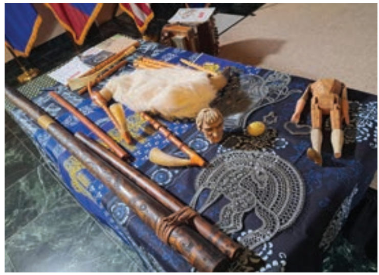
Exhibit of Slovak fujara, flutes, bagpipe, and blueprint fabrics.