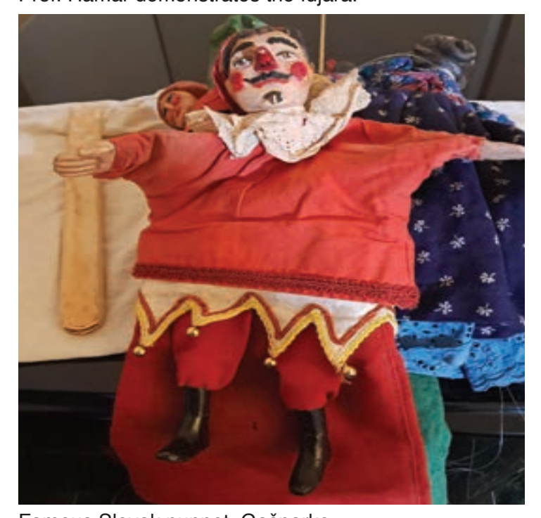
Famous Slovak puppet, Gašparko.